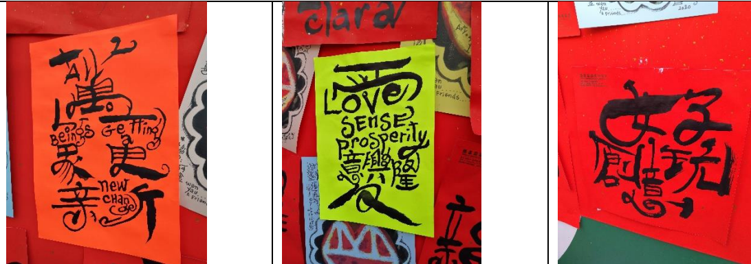
Carmen Or's works: