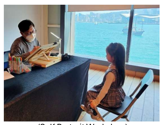
(Self Portrait Workshop)

Sponsored by Hong Kong-based Pacific Basin Shipping Limited, in collaboration with the Hong Kong Seamen's Union and Maritime and Aviation Training Fund (MATF) of Transport and Logistic Bureau, HKMM opens its door for free to the public on 23 June 2024 to show gratitude to seafarers and share maritime knowledge to the public. Pacific Basin is one of the world's leading owners and operators of modern Handysize and Supramax dry bulk