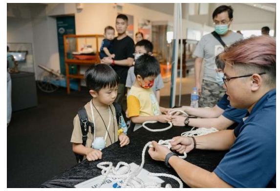
(Pacific Basin Game Booths)