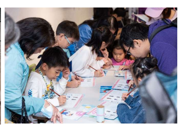
(Treasure Hunt Worksheets)