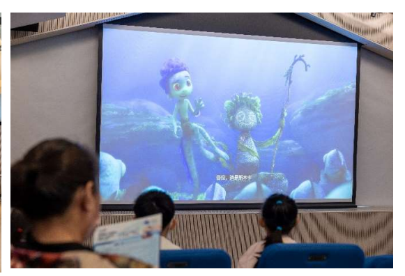
(Marine Movie Screening)