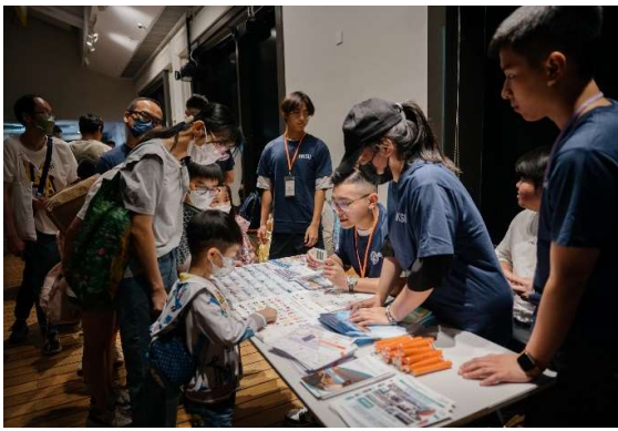
(Hong Kong Seamen's Union Game Booths)