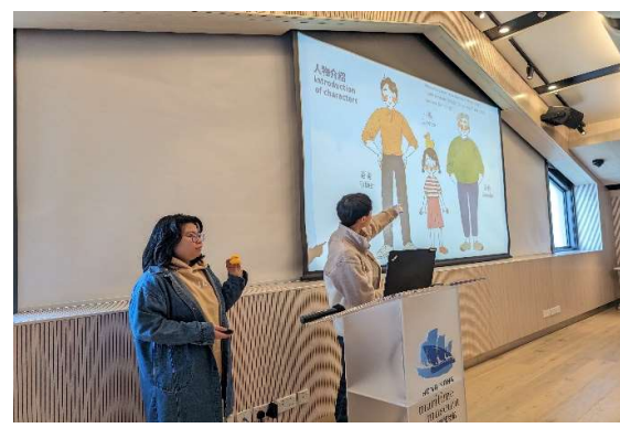
(Storytelling – Little Carmen's Maritime Dream)