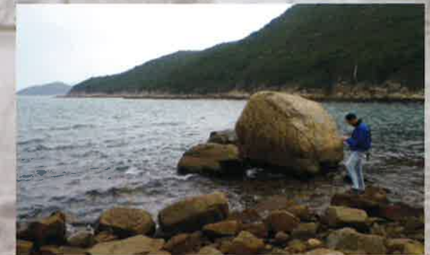
Kau Sai Chau - a large rock near Kau Sai Chau village that, according to local folklore, is the ligament of a scallop (pronounced 'Kau' in Cantonese) joining its two shells, the two represented by Kau Sai Chau and nearby Jin Island. It is the origin of the name Kau Sai Chau.

If you know of sites or have stories related to the Hong Kong's maritime and underwater cultural heritage, the HKUHG would be very keen to hear from you at hkuhgroup@gmail.com